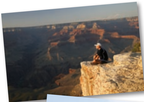
The Grand Canyon